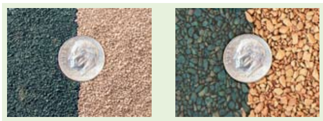
Profile™ Greens Grade™— meets USGA particle size recommendations. Ideal for sand-based root zones.

Available in 50-lb bags 2000-lb bulk sacks Bulk dump trucks (23-25 tons) (Available in both Natural and Emerald)