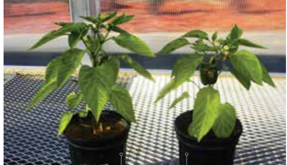
50/50 Potting Soil and Profile® Lawn & Landscape Porous Ceramic Soil Conditioner