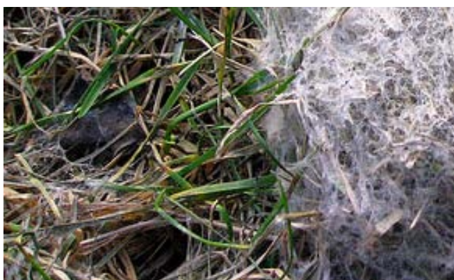
Grey snow mold