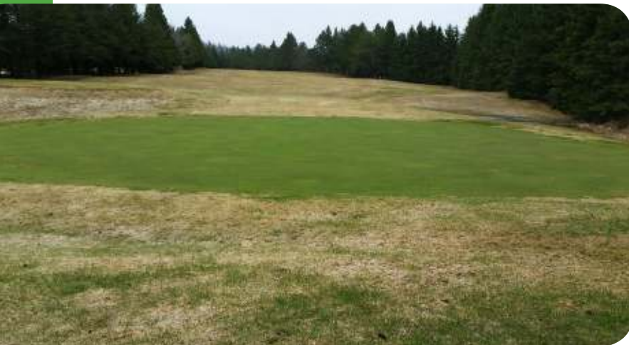
Green treated with Insignia Duo and collars untreated. Clear Springs Golf Club.