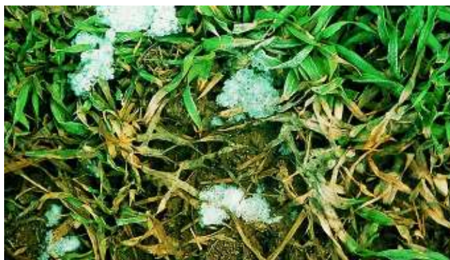
Pink snow mold

Re-entry interval: Once sprays have dried