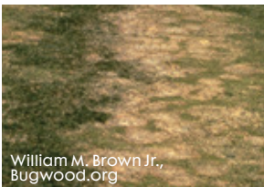
William M. Brown Jr., Bugwood.org

AFFIRM WDG + TOURNEY /VS/ UNTREATED Applied November 5 to bentgrass at 27 g/100 m 2 Affirm WDG + 11.2 g/100 m 2 Tourney. Fred Vaughn, Horseshoe Valley, ON, 2013